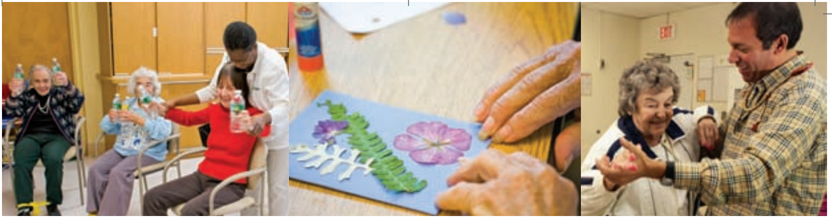
Friendship House offers an array of enjoyable activities specially designed to help its clients maintain their physical and cognitive skills.

The Master Gardeners' and Pet Therapy programs, two of the center's most popular activities, will continue along with the nurse service.